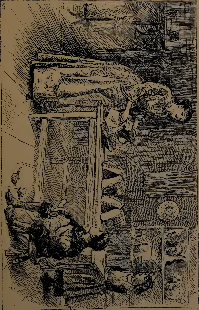
“THAN SHE HAS, WHEN HER BAKING COMES OUT RIGHT?”